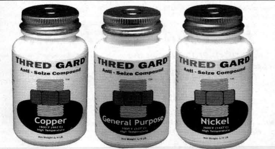
Thred Gard's powerful formula is nondripping and nonhardening, making it ideal for use on nuts, bolts, bushings, turbines, sleeves, couplings and other interlocking components.

www.gasoila.com. Gasoila Chemicals, a Federal Process Company, offers a diverse line of quality products for the petroleum, plumbing, LP Gas, HVAC, automotive and general industrial markets. From industrial thread sealants and cutting oils to gas gauging pastes and industrial cleaning chemicals, Gasoila has long been the professional's choice for tough, reliable chemical products that get the job done.